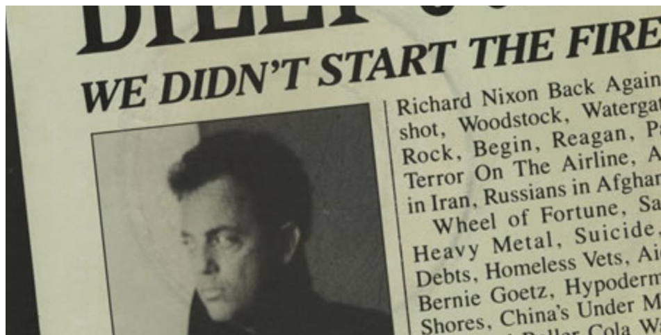
The cover of Billy Joel’s 1989 single “We Didn’t Start the Fire”

the season with the lighting of the New Flame at the Easter Vigil—the flame used to light the Paschal candle and remind everyone that Christ is risen from the dead. The season ends with the Feast of Pentecost, the day we celebrate the descent of the Holy Spirit among the disciples as tongues of fire, the birthday of the church and the beginning of our work to proclaim the Gospel of Jesus Christ to the ends of the earth.